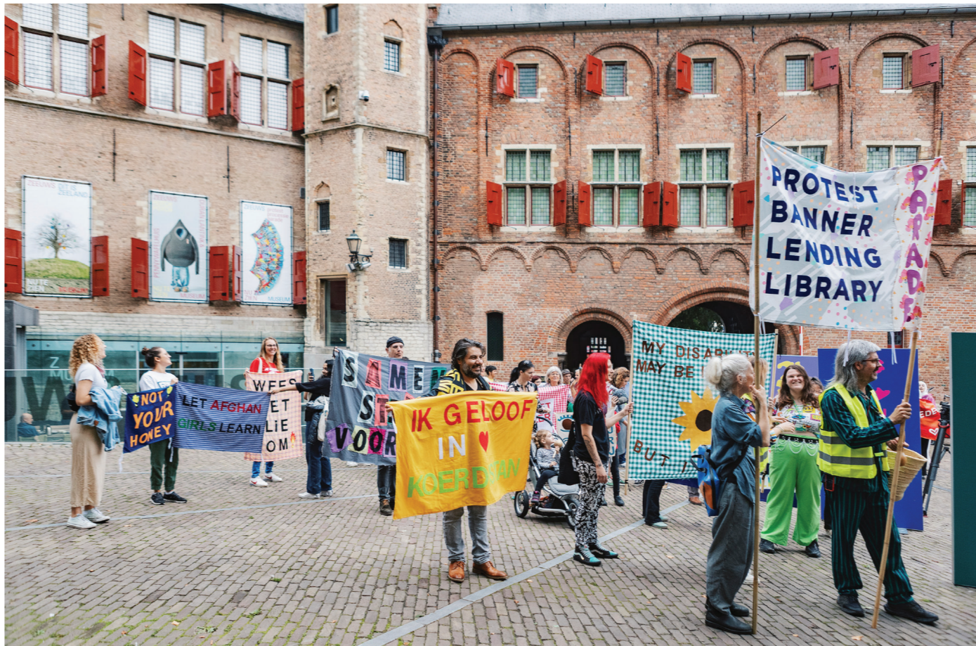
Manifestation Protest Banners, 2023.

Organisation The Zeeuws Museum is a foundation (the Zeeuwse Museum Foundation) led by a director appointed and supervised by a supervisory board. The foundation's statutes incorporate the rules of the Cultural Governance Code. The museum's team consists of approximately eighteen full-time staff and several project-based temporary staff. Around fifty volunteers contribute to activities in and around the museum. We also work with freelance docents, exhibition builders and technical support staff. We operate within the ICOM Code of Ethics for Museums and the Diversity & Inclusion Code and we are affiliated with Musea Bekennen Kleur (Museums See Colour).