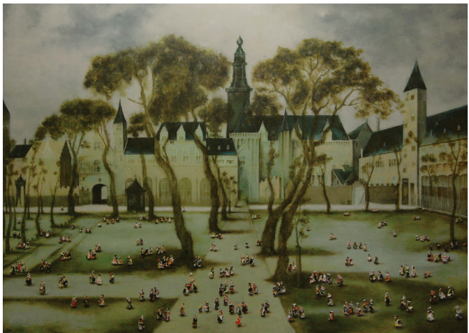
Hiddenor Mitsue, Abbey Square

You can opt for a standard or a tailor-made package. Scan the QR code to see which suits you best: