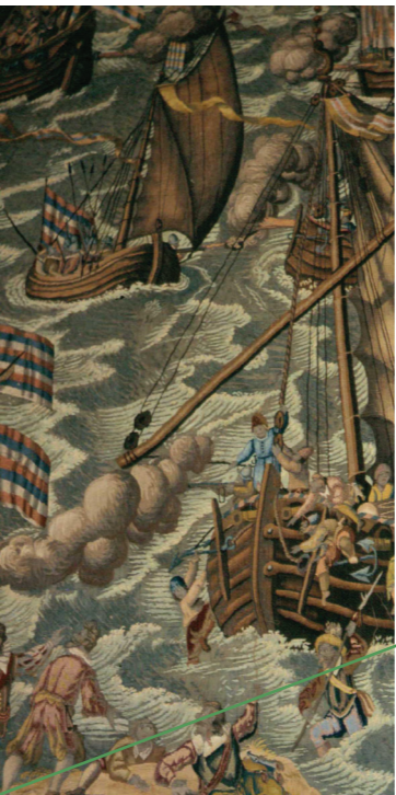
Detail wandtapijt Blaygen op Zoom.