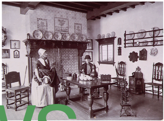
Watchroom, old setup in Zeeuws Museum

Organisation The Zeeuws Museum is a foundation (the Zeeuwse Museum Foundation) led by a director appointed and supervised by a supervisory board. The foundation's statutes incorporate the rules of the Cultural Governance Code. The museum's team consists of approximately eighteen full-time staff and several project-based temporary staff. Around fifty volunteers contribute to activities in and around the museum. We also work with freelance docents, exhibition builders and technical support staff. We operate within the ICOM Code of Ethics for Museums and the Diversity & Inclusion Code and we are affiliated with Musea Bekennen Kleur (Museums See Colour).